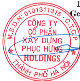
Dang Trong Duc